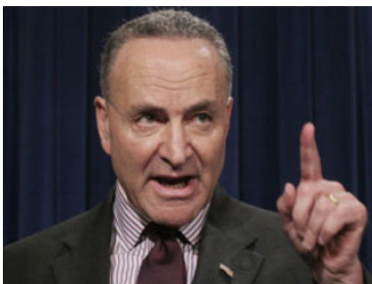
Senator Charles Schumer

New York's two Senators that represent us in Washington D.C.