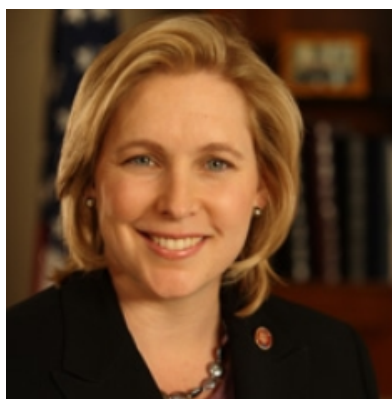
Senator Kirsten Gillibrand